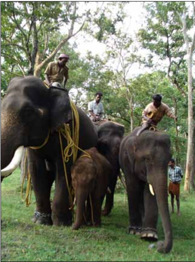
Figure 3. The feminine appearance of the ‘tusker’ when compared to normal kumkhi tuskers. Note the less prominent muscles at the commisures of tusk, narrow base of the trunk and less pronounced frontal bump.