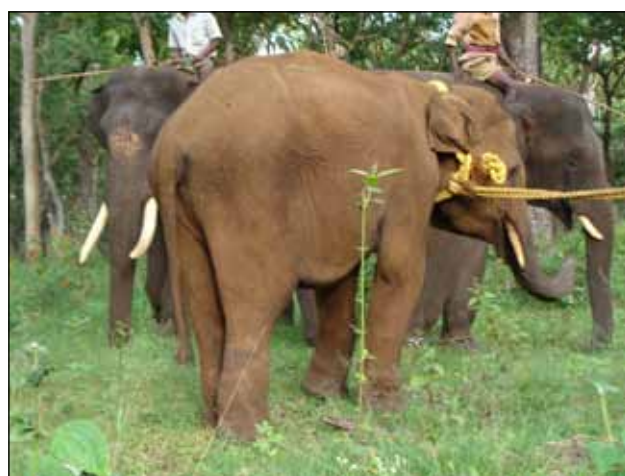
Figure 1. The wild 'tusker' after restraint using kumkhi elephants (note the length of tusks which are proportionately longer than 'tushes').

The Forest Veterinarian, Mudumalai Tiger Reserve (senior author), was called upon to capture and translocate the animal. The animal was darted using a Dist-Inject dart gun with 150 mg xylazine. During xylazine anaesthesia, there was no relaxation and extrusion of the penis, which led to doubts regarding the sex of the animal. The elephant was restrained with the help of kumkies (trained captive elephants) and a thorough examination of the location and appearance of genitalia was carried out (Fig. 1). Blood was collected from the ear vein in heparinised vacutainers. The animal was