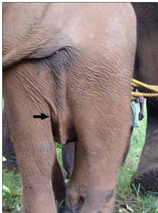
Figure 2. The features of the 'tusker' showing deviations from a normal female, the presence of a non-prominent penile cord (arrow).

Karyotyping of metaphase spreads from blood lymphocyte culture revealed 56 paired chromosomes, with an XX chromosome complement (Fig. 4). The elephant was thus determined to be a genetic female with partial masculinization, suggestive of female pseudo-hermaphroditism.